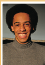
eden origin she, her, hers, he, him, his